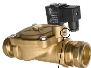
Emergency override manual release grub screw head.